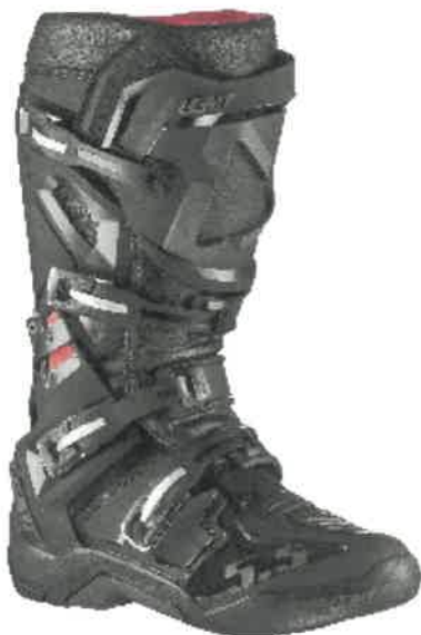
Boot 5.5 Flexlock Blk