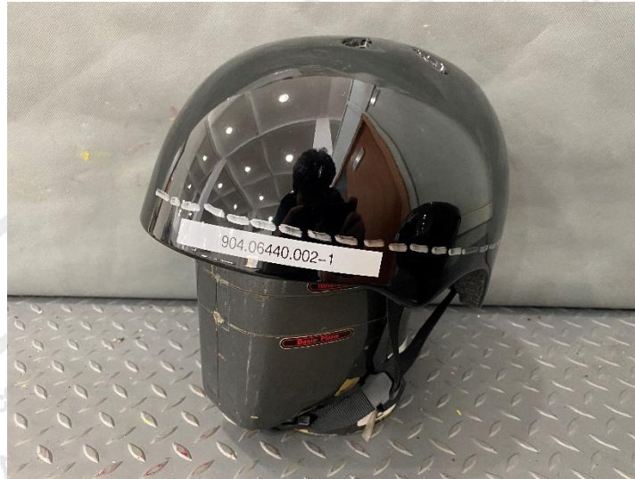
904.06440.002 – MTB URBAN 1.0 JR/LT2113 (Black)